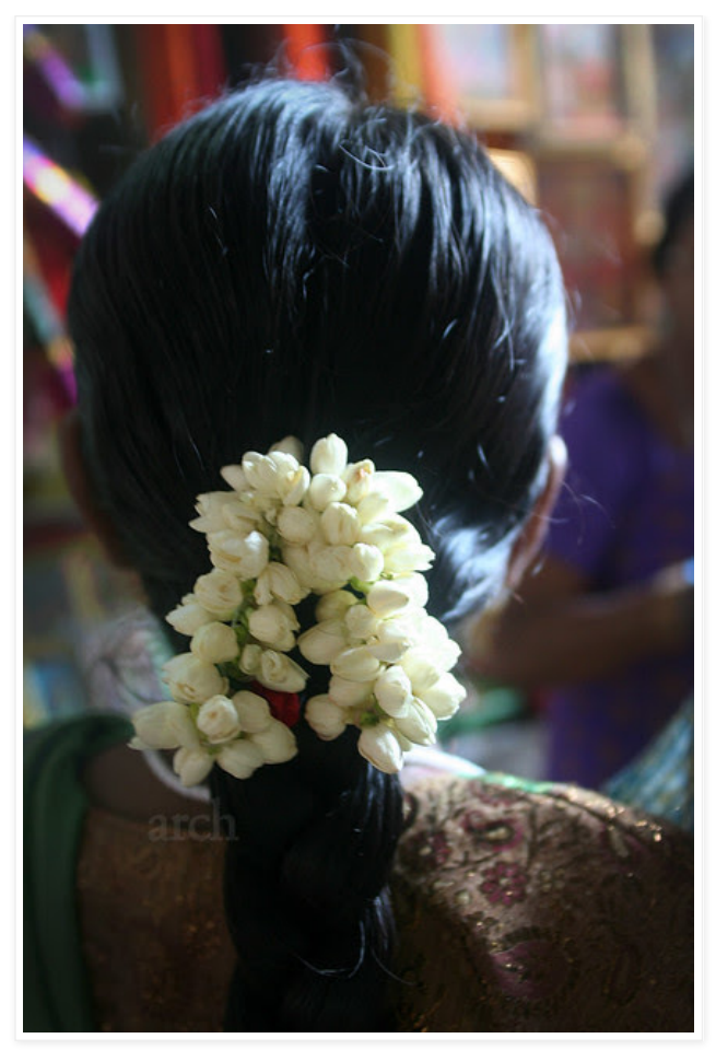
Fragrant \ 'Malligai' \ on \ well-oiled \ hair \ is \ a \ common \ sight \ in \ southern \ India \ and \ especially \ in \ Madurai