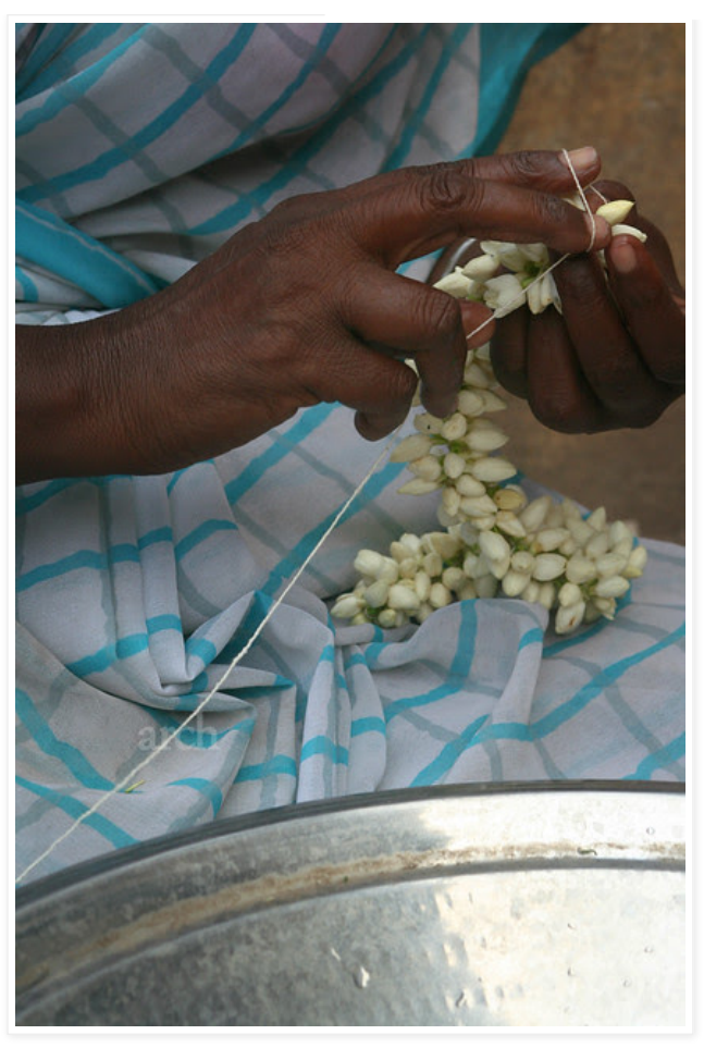
The 'Malligai' buds being woven into a neat garland.