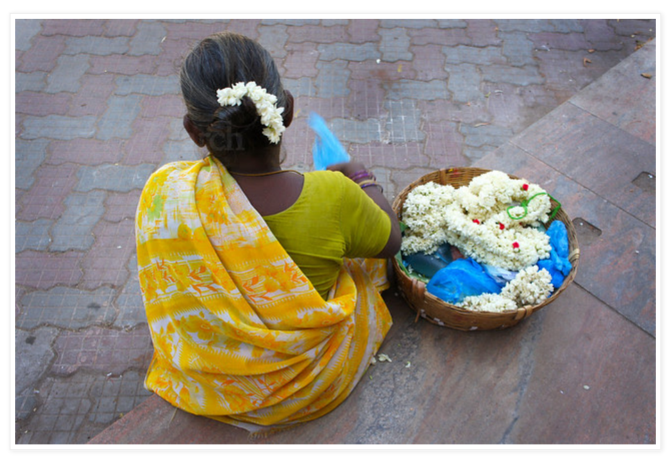
Adorn and sell.