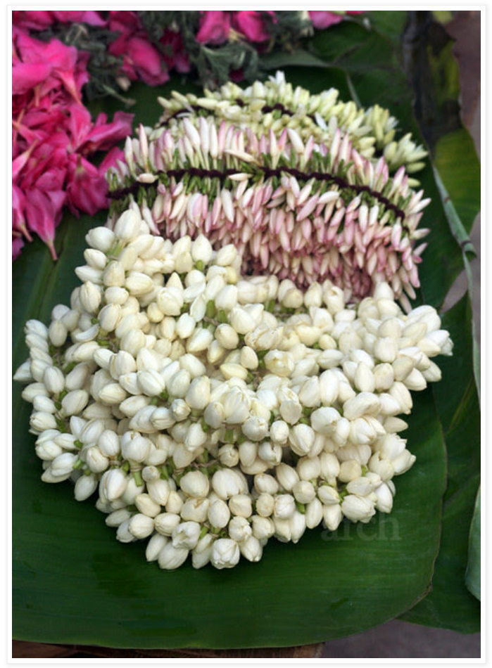
Madurai is famous for it's big, fragrant variety of 'Malligai' or Mogra

From aqua blues of the Andamans to fragrant 'mogras' of Madurai. Pardon me if I keep oscillating between a couple of destinations that we travelled to while away from my blog.